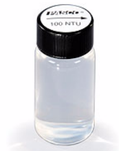
100 NTU Standard, 6 milliliters (mL)